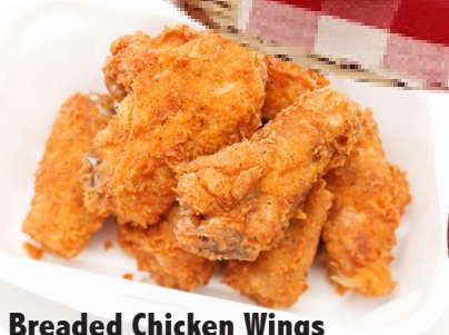
Breaded Chicken Wings