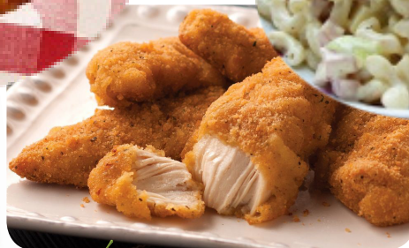
Breaded Chicken Fingers