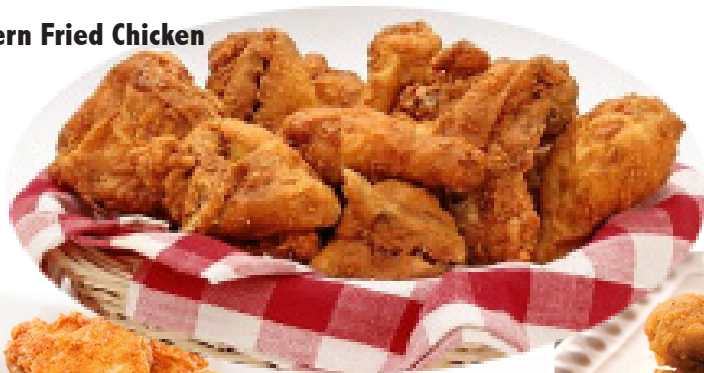
Southern Fried Chicken