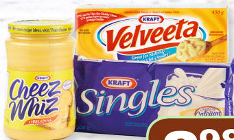
Kraft Cheez Whiz or Cheese Singles Or Velveeta. Select Varieties. 450 g.