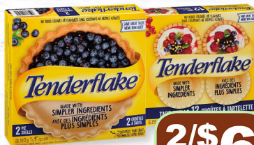
Tenderflake Tart or Pie Shells Select Varieties. Frozen. 255 - 454 g.