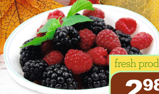
Fresh Blackberries or Raspberries Product of U.S.A. #1 Grade. 170 g.