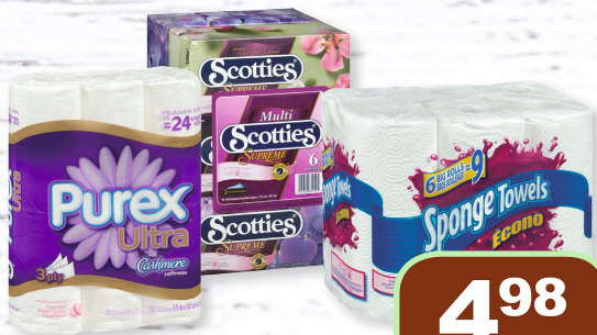
Purex Bathroom Tissue 12 Roll. Select Varieties. Scotties Facial Tissue or Spontowels 6 Roll.