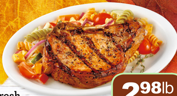
Fresh Pork Loin Center Cut Chops Or Fast Fry Chops. Bone In.