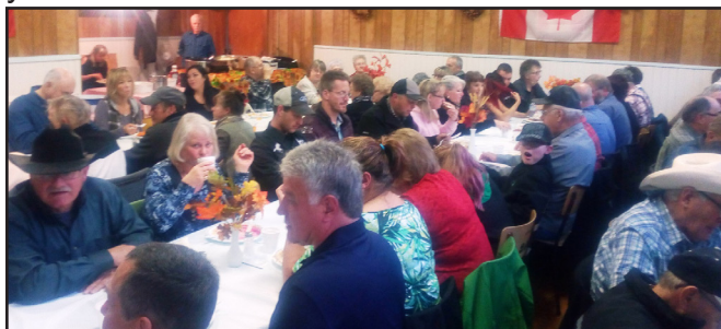
Above - The crowd awaits the always amazing meal! Below - Centreldodge Members and volunteers.

Centreldodge Community Hall's Annual Autumn Supper was a great success again this year! The Community Association for Centreldodge would like to send out a big thank you to all of our loyal supporters and the hard working hands of its members who once again made the event such a success. Thank you to all of you!