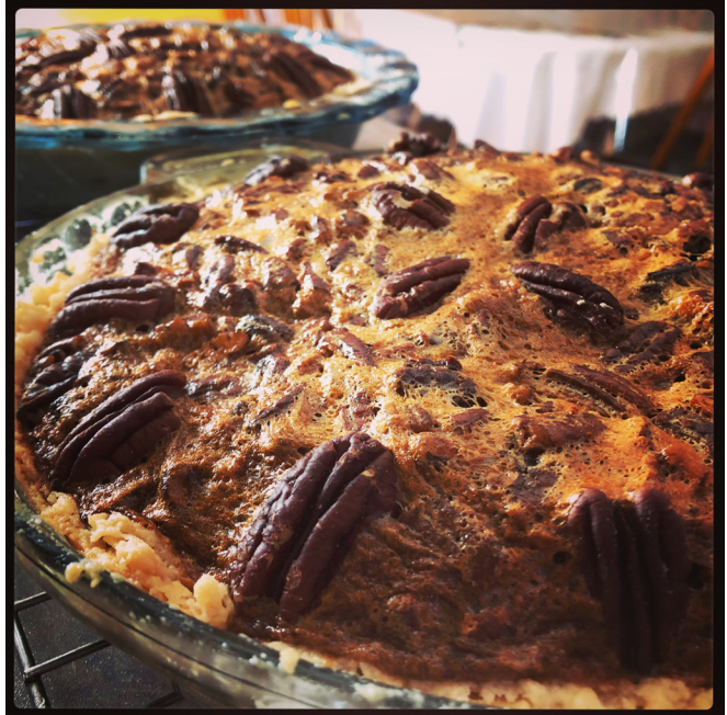
Above: The fresh, home-made pies were the perfect end to a perfect feast!

support of the community. Thank you to all of those who joined us for friendship, fellowship, and a feast!