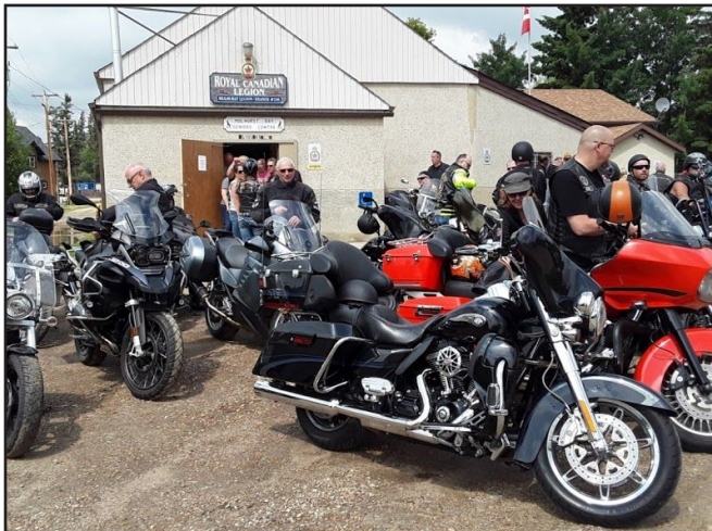
Members of 'Motorcycle Ride Against Cancer' arrive at the Royal Canadian Legion, Mulhurst.

During their run, the 70 motorcycles stopped at Legion's in St. Albert, Devon, Mulhurst, Wetaskiwin and Leduc.