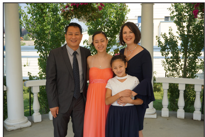
The Yee family in 2018