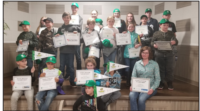
2018-19 Whoop It Up 4H Multi-Club Members & Leaders