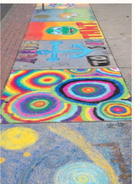
Drop in For Chair Yoga or Adult/child Yoga Pick Up Chalk Pkg.

For more information on these and other programs and services offered by Breton and Area FCSS