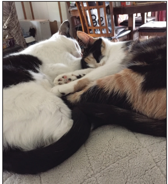
Lucky and Poppy having some cuddle time. Have a cute or funny pet picture or a wildlife picture taken in the area? Email it to media@community39.com or text to 780.887.0077