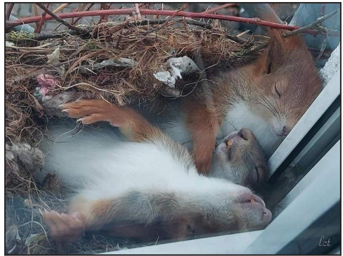
Squirrels caught sleeping outside of a window. AWWWWWWW!!!!

Have a cute or funny pet picture or a wildlife picture taken in the area? Email it to media@community39.com or text to 780.887.0077