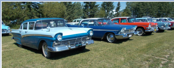
Cars - Ford

Partial Listing Only Listing Includes a HUGE Selection of Project Vehicles, Parts & Accessories Plus Miscellaneous & Much Much More