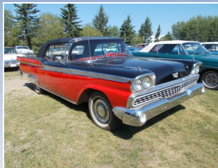
Cars - Meteor

1965 Meteor Montcalm 2dr Convertible Car w/ 352, Auto 1965 Meteor Montcalm Convertible w/ 352 V8, Auto 1965 Meteor Montcalm Convertible w/ 390, Auto 1965 Meteor Montcalm Convertible w/ V8, Auto 1965 Meteor Montcalm 2dr Hardtop w/ 390 V8 1968 Meteor Montcalm Convertible w/ 390, Auto 1955 Meteor 4dr Sedan w/ V8, 3 on the Tree 1956 Meteor Niagara 4dr Sedan w/ 272 V8, Auto 1956 Meteor Niagara 4dr Sedan w/ V8, 3 on the Tree 1956 Meteor Rideau 4dr Town Sedan w/ V8, Auto