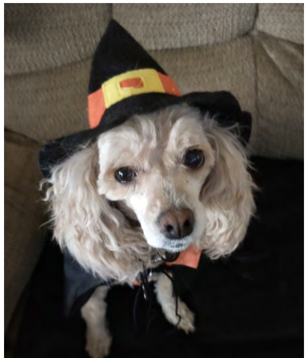
Isn't Muffins adorable? All ready for Halloween!

Search and rescue workers have recovered 100 bodies and expect that number to climb as digging continues