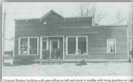
Original Rolston building with post office on left and store in middle with living quarters on right.

There was enough population in the community to form a village on December 31, 1949. By January 1, 2017 the population had increased to just over 1000 residents and officially became the Town of Thorsby.