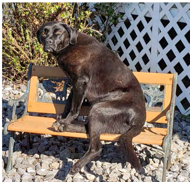
Meet Betty, she forgets she's a dog sometimes!

I couldn't afford an Ancestry DNA kit, so I just announced that I had won the Lottery. I soon found out who all my relatives are.