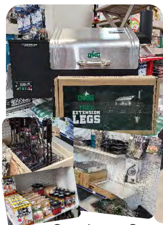
Smokers, Smoking Pellets & Accessories