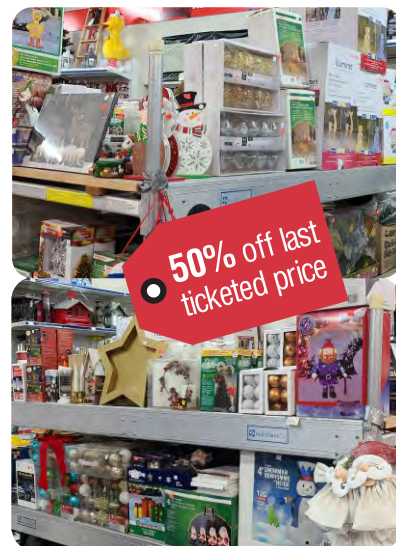
Discounted Christmas Decor on Dock