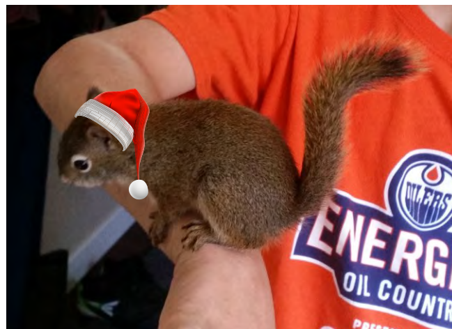
Here is a cute picture of Simon the Squirrel

Have a cute or funny pet or wildlife picture from the area that you'd like to share? Email it to media@community39.com or text 780.499.9006