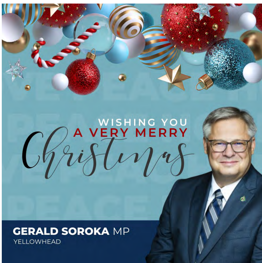
GERALD SOROKA MP YELLOWHEAD

Mail: Genesee Repowering Project C/O Stakeholder Engagement Capital Power 10th Floor EPCOR Tower, 10423 101 Street NW Edmonton, AB T5H 0E9