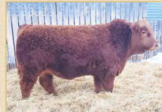
RT 181J - Homo Polled Purebred Sire: KHG Commader 50G Dams Sire: OH Kay Dynasty 28D