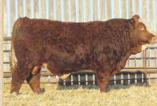
Black Gold Mr. Adonis Son Brothers will be on offer

FEBRUARY 24, 2022 1:00 PM • RIMBEY AGRIM • RIMBEY, AB