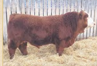
RT 211J - Polled-Sire Verified-Non Dilutor Purebred S: KHG Commader 50G DS: Starwest Pol Blackberry