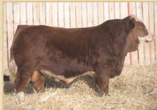
STBS 77J - Polled Purebred S: BEE Ballistic 1C DS: Black Gold Wispers Shadow