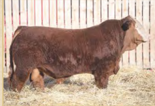
STBS 21J - Polled Purebred S: PWK Max Factor 137Y 17B DS: Wild-West Red Aurora