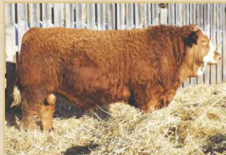
R-Five Gideon 67G Sons will be on offer