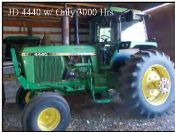
ID 4440 w/ Only 3000 Hrs