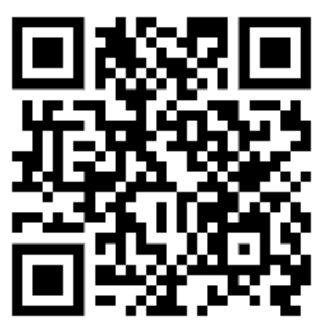
The Firearm Buyback Program Price List <u>www.publicsafety.gc.ca/</u> <u>cnt/cntrng-</u> <u>crm/frrms/bp-en.aspx</u>