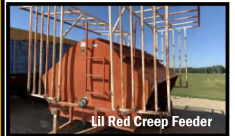
Lil Red Creep Feeder