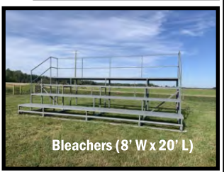
Bleachers (8' W x 20' L)