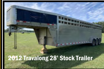
2012 Travalong 28' Stock Trailer

Directions: From the Buck Creek Service Station on Hwy#22, 1 km East on SH#616 or West of Breton on SH#616, 24 km. (Rural Address 6412 SH616) - WATCH FOR SIGNS