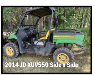
2014 JD XUV550 Side x Side