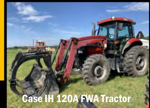
Case IH 120A FWA Tractor

Directions: From the Buck Creek Service Station on Hwy#22, 1 km East on SH#616 or West of Breton on SH#616, 24 km. (Rural Address 6412 SH616) - WATCH FOR SIGNS