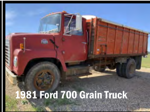
1981 Ford 700 Grain Truck