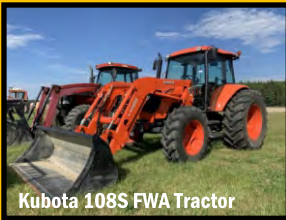
Kubota 108S FWA Tractor