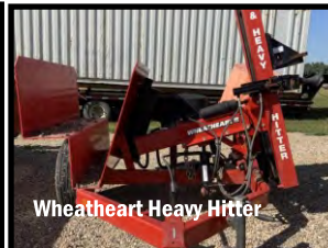
Wheatheart Heavy Hitter