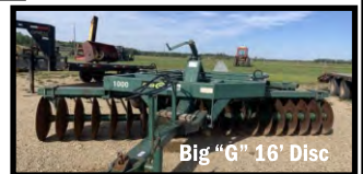
Big "G" 16' Disc