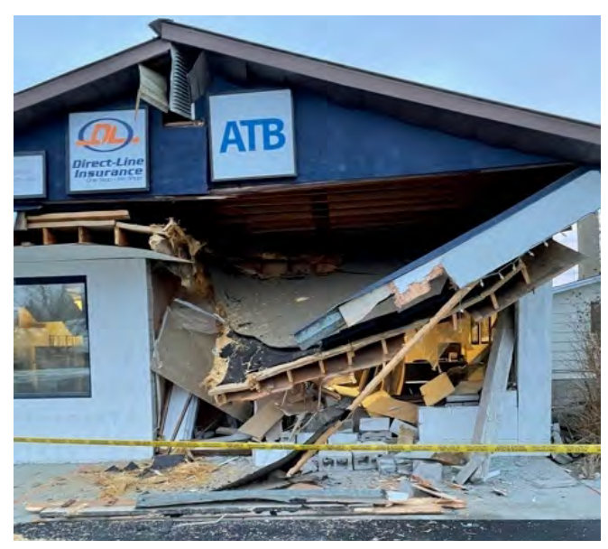
Picture taken approximately a year ago after the break-in November 2021. There have still been no arrests so if you have any information on this crime please contact the RCMP.

We want your local articles, stories & pictures! ITS FREE