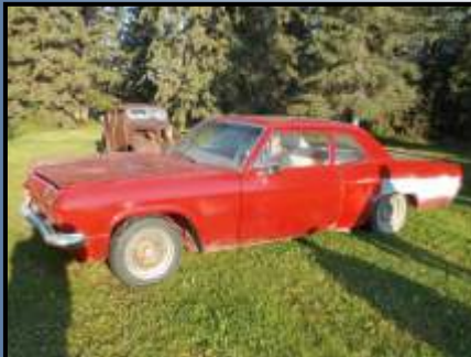
License No. 165690