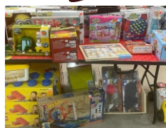
Table of Toys at reduce prices!