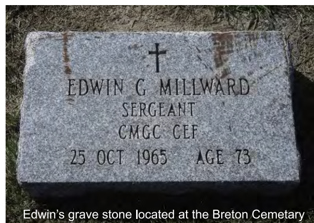
Edwin's grave stone located at the Breton Cemetery