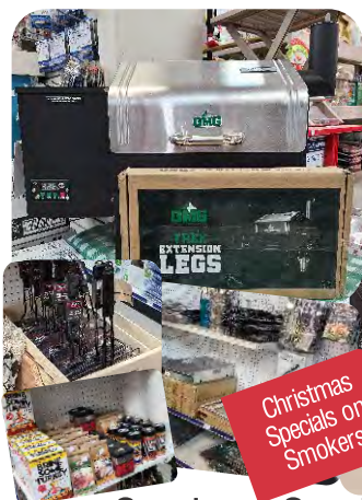
Christmas Specials on Smokers