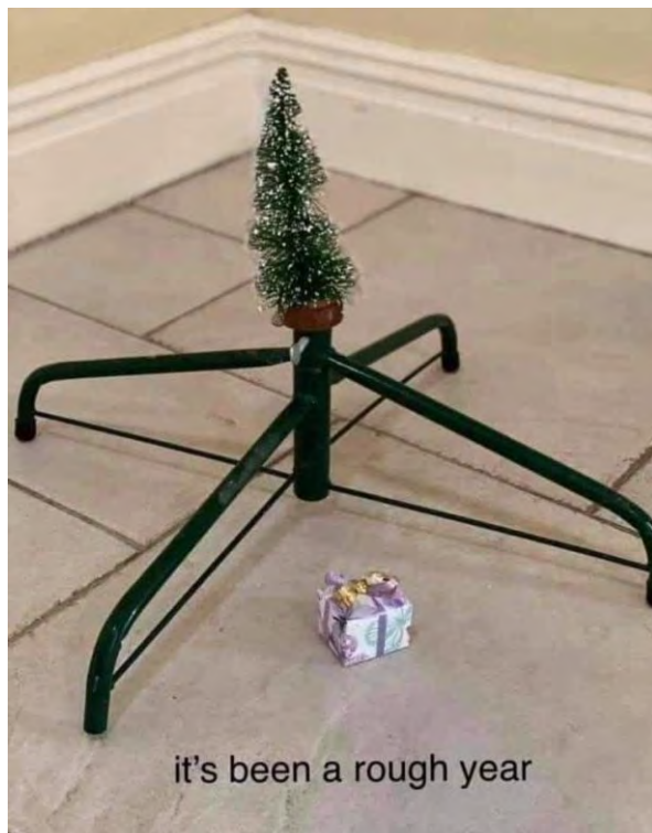
it's been a rough year

Christmas time is great because you can shout "DON'T COME IN HERE!" and people think you are wrapping presents. When you just want to drink wine in peace and not share your chocolates with anyone.