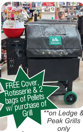
Smokers, Smoking Pellets & Accessories