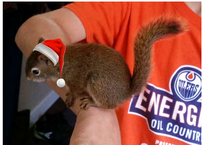
Here is a cute picture of Simon the Squirrel

Have a cute or funny pet or wildlife picture from the area that you'd like to share? Email it to media@community39.com or text 780.499.9006