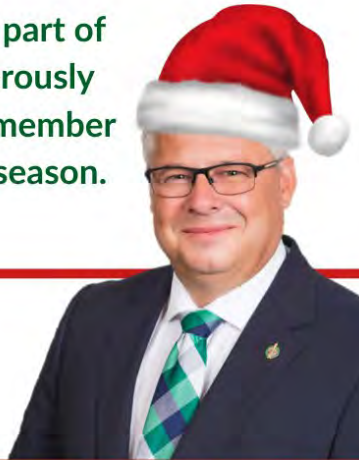
Gerald Soroka, MP Yellowhead