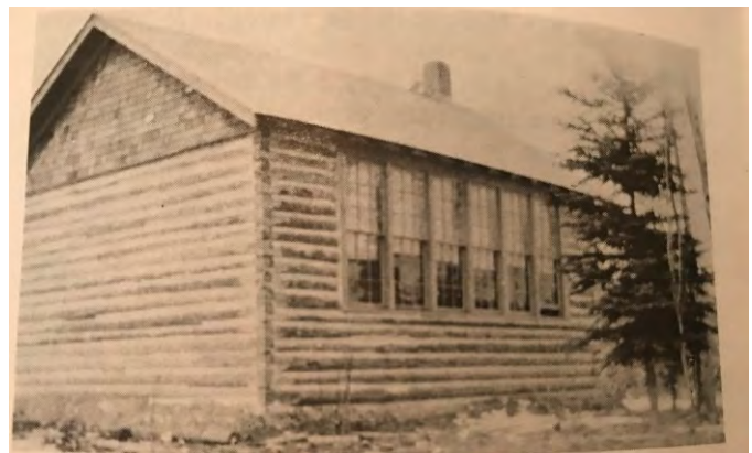
New Moose Hill School Circa 1932