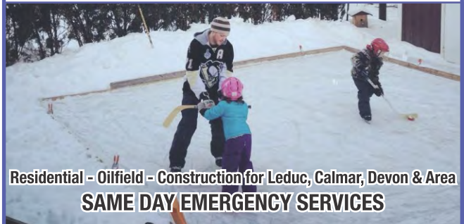
Residential - Oilfield - Construction for Leduc, Calmar, Devon & Area SAME DAY EMERGENCY SERVICES

Cisterns Skating Rinks Hot Tubs Pools Dust Control