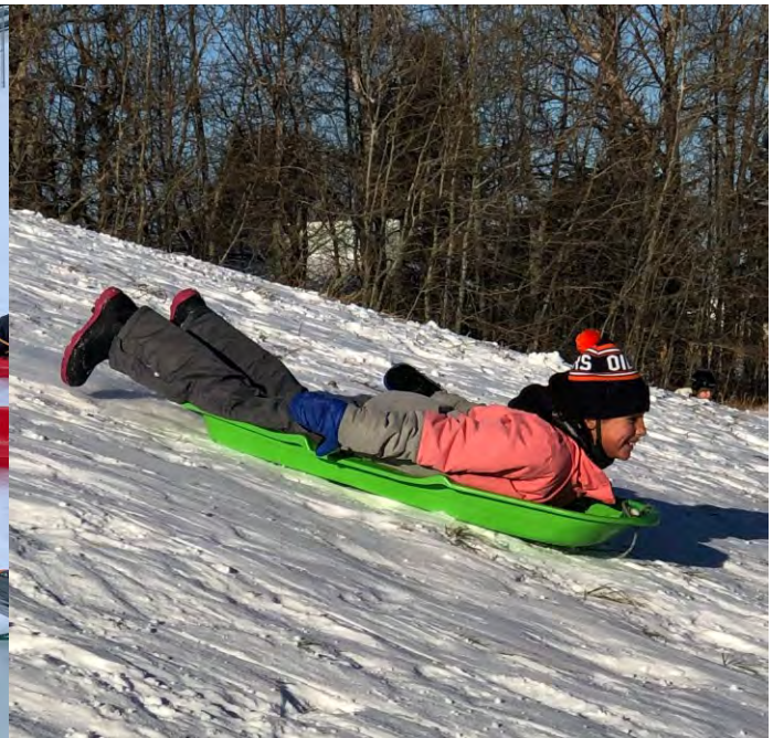
Sledding fun at Warburg School! More Warburg School News inside this issue!