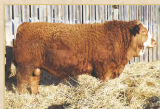
R-Five Gideon 67G Sons will be on offer