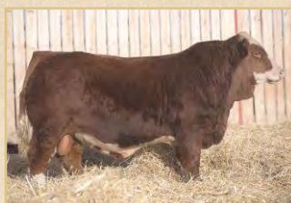
STBS 77J - Polled Purebred S: BEE Ballistic 1C DS: Black Gold Wispers Shadow