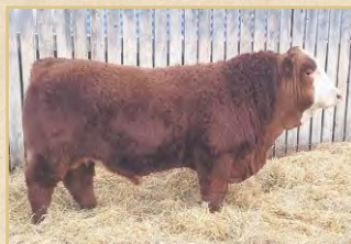
RT 211J - Polled-Sire Verified-Non Dilutor Purebred S: KHG Commader 50G DS: Starwest Pol Blackberry