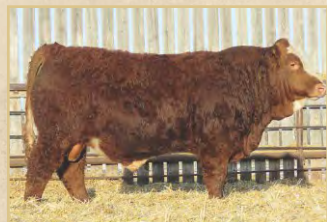
Black Gold Mr. Adonis Son Brothers will be on offer