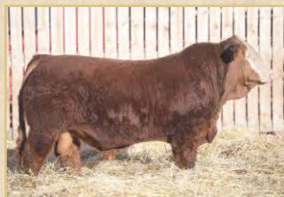
STBS 21J - Polled Purebred S: PWK Max Factor 137Y 17B DS: Wild-West Red Aurora