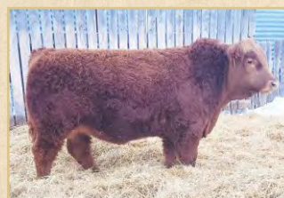
RT 181J - Homo Polled Purebred Sire: KHG Commader 50G Dams Sire: OH Kay Dynasty 28D