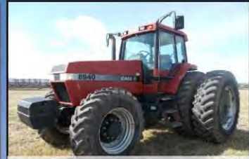
Case IH 8940 FWA Tractor

Owners: Colleen at (403) 783-9703 or Dale at (403) 963-2442