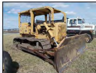
AC HD11 Crawler