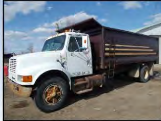
1993 IHC S/A Grain Truck