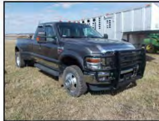
Ford F350 4x4 Dually Truck