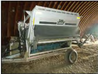
Jiffy 920 Bale Processor