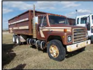
1980 IHC T/A Grain Truck