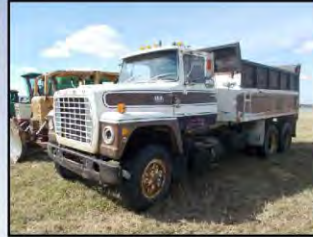
1980 IHC T/A Gravel Truck