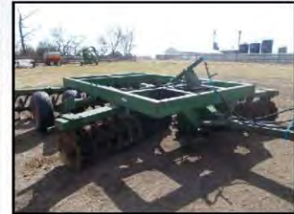
Big G Green Line 16' Disc