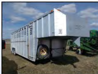
1992 Wilson 24' Trailer