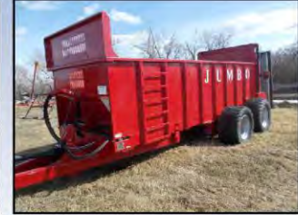
Jumbo T/A Manure Spreader