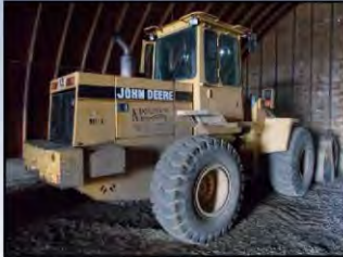
JD 544G 4wd Wheel Loader

COMPLETE Listing Online at www.allenolsonauction.com