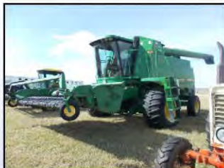
JD 9500 Sp Combine