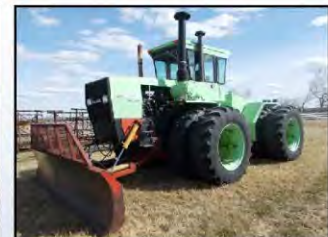
Steiger Cougar 4wd Tractor