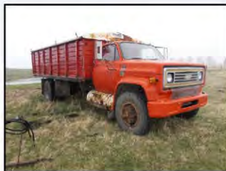
Chev S/A Grain Truck