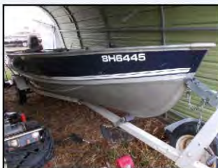
Lund 16' Boat