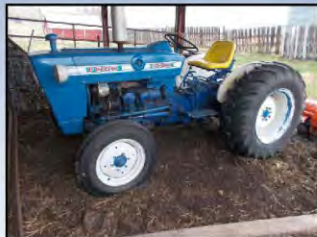
Ford 3000 2wd Tractor