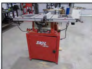
Large Assortment of Tools