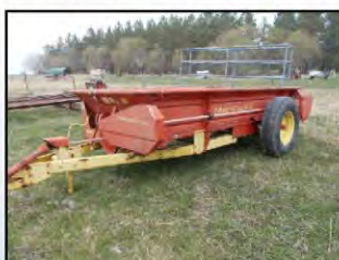
NH 518 S/A Manure Spreader