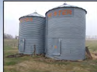
Twister Grain Bins