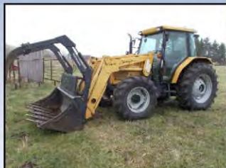
Challenger FWA Tractor