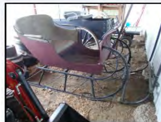
Assorted Horse Equipment