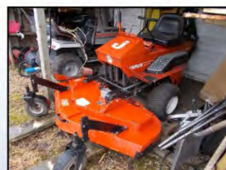
Deines 5' Front Mtd Mower