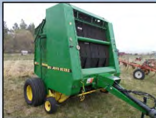
JD 535 Rd Baler