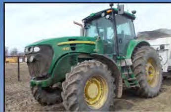
JD 7830 FWA Tractor

For More Information, Contact Jason at (403) 348-9101