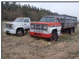
Chev & GMC Trucks