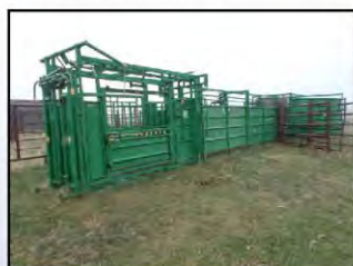
Real Industries Cattle System