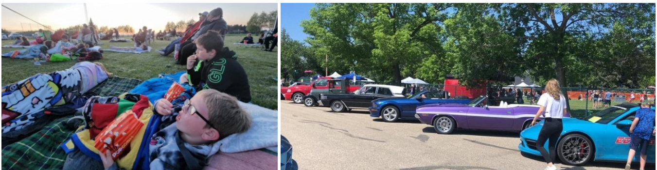
Outdoor movie at the Ball Diamonds