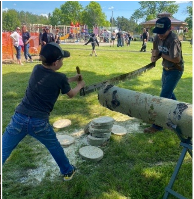
Log sawing in the park