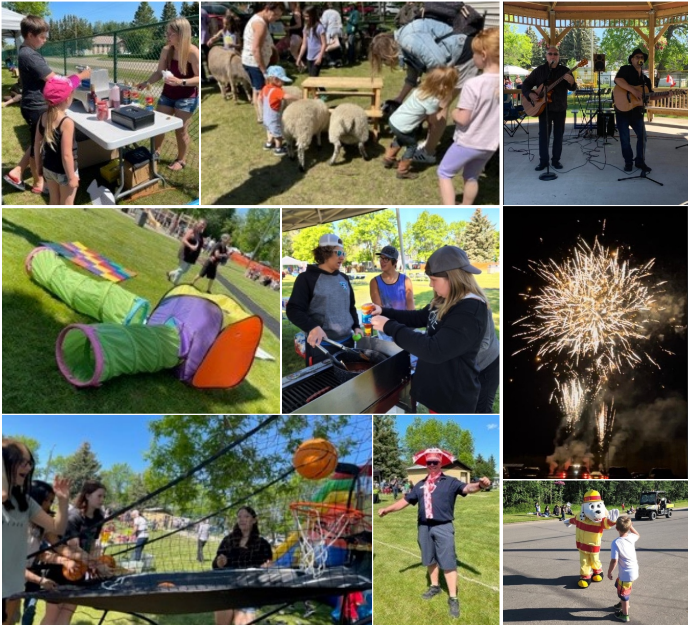
Parade, Fireworks, Food, Fun & Games for Everyone!