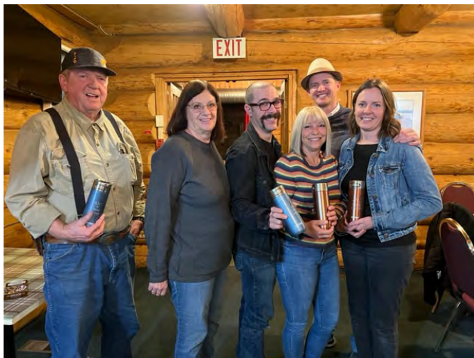
2022 Trivia Champions the "Antross Flapjacks"

The first order of business for the teams was to come up with a unique team name. Some of the more interesting names included: "Start the Car", "Top Hats", "Repeat Offenders", "Miss Swiss & the Milkmaids" and "Sex Drugs and Sausage Rolls". You can only wonder what goes on deep in the minds of trivia players. The contest consists of six rounds with ten questions in each round. This year the teams were challenged on their knowledge of: Useless information, Animal World, Behind Every Great Man...Famous Wives, Food, Scary Movies, Formerly Known As, So You think You Can Drink, Da Train Da