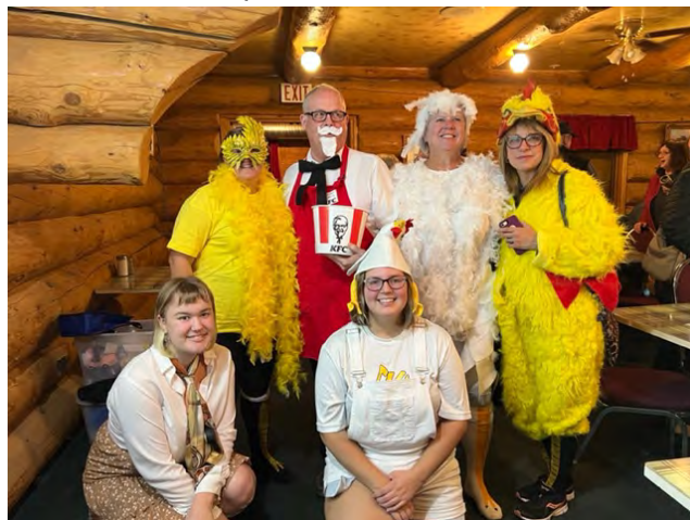
The "Finger Licking Good" team was awarded Best Dressed.

Train, Double Duty "J", and of course this year's movie "It's the Great Pumpkin Charlie Brown".