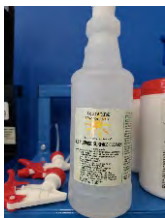
All Purpose Surface Cleaner 1L Reg $6.99 ea on Sale $4.00 ea or $40 for case of 12