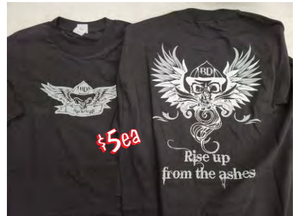
Backdraft S/S Shirt Quantity 4, Size XL 2 Left 3 Size XXL