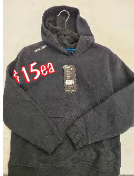
Bauer Hoodie Size Youth Medium Quantity 1

2023 Clearance Super Sale while inventory lasts