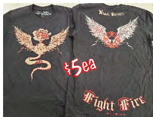
Black Helmet Fight Fire Ladies Size XXL Quantity 4