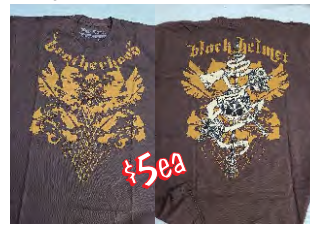
Black Helmet Brotherhood Mens Size XXL Quantity 1