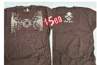
Black Helmet Prayer Quantity 3 Mens Size XXL 1 Size XL 1 Size L SOLD only XXL Left