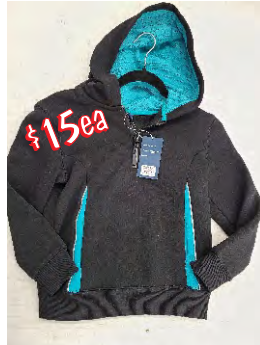
Renegade Hoodie Size Youth 4, 8, 12, 16 Mens XS, M, L Quantity 1 of ea size