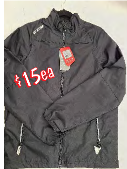
CCM Jacket Size Mens Small Quantity 1