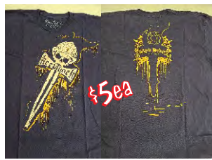
Black Helmet Keep Back Mens Size XXL Quantity 1