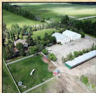
Beckman Real Estate