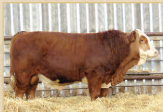
SWS 33K - Polled Fullblood S: R-Five Gideon 67G DS: R-Five Sampson 43Y