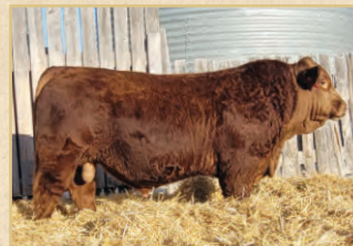
RT 73K - Homo Polled S: KWA Roosevelt 63F DS: MVRN Pol Red King 163A