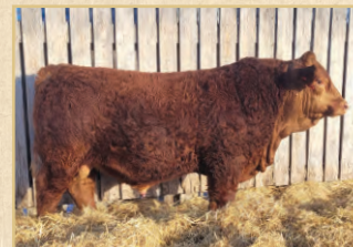
RT 82K - Homo Polled S: SVS Tycoon 841 F Dams Sire: MVRN Pol Red King 163A