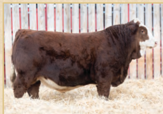
STBS 107K - Fullblood S: Anchor D Shazam 318E DS: STBS Ethel 10G