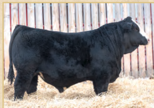
STBS 1J - Polled Purebred S: Sunrise Captain Blaze 5C DS: STBS Safe Bet 4F