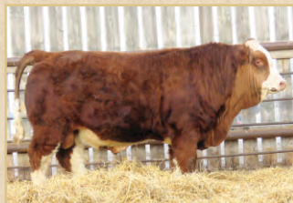
BSSR 171K - Full Fleckvieh S: Virginia Gelineas 525H DS: PRL Torque 40T