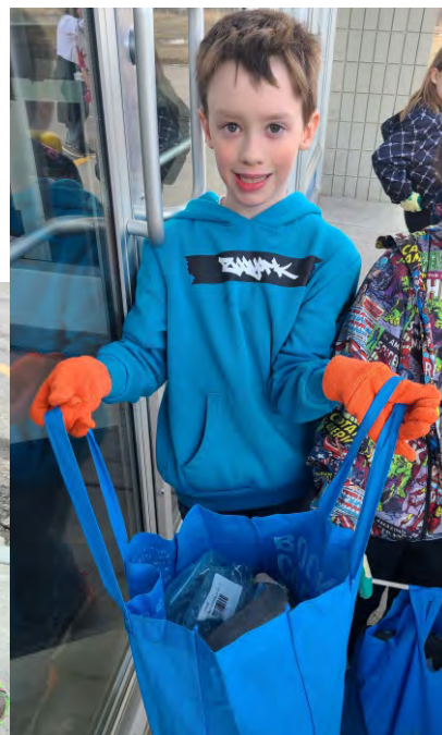
TES Grade 2 students were eager to show off the garbage they picked up on Friday, April 14 from the streets of Thorsby.