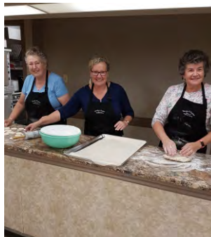
It was perogy making time at the community hall on October 24. The Thorsby Historical Society will be selling these perogies at their Christmas Market on Saturday, November 4 from 11am - 7pm and Sunday November 5 from 11am - 4pm at the Thorsby Community Centre.