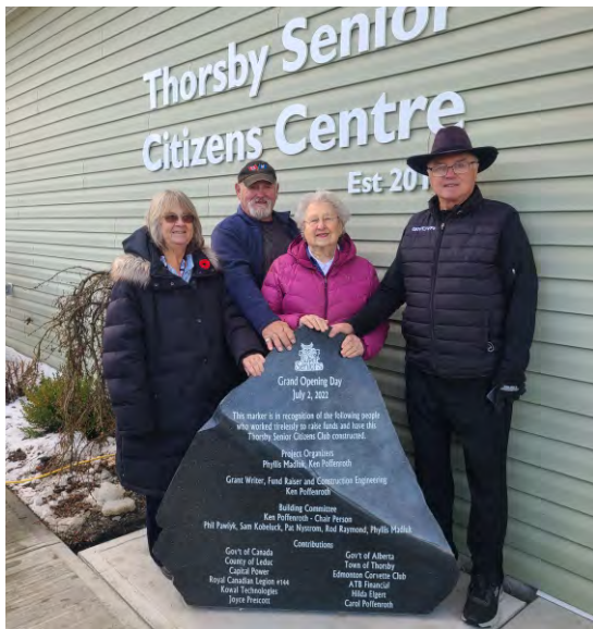
The Thorsby Seniors stone was delivered on October 17. It is engraved to thank and commemorate all of the volunteers and sponsors who contributed to the construction of the Thorsby Senior Citizens Centre. The other half of the rock is at the Thorsby Water Treatment Plant.