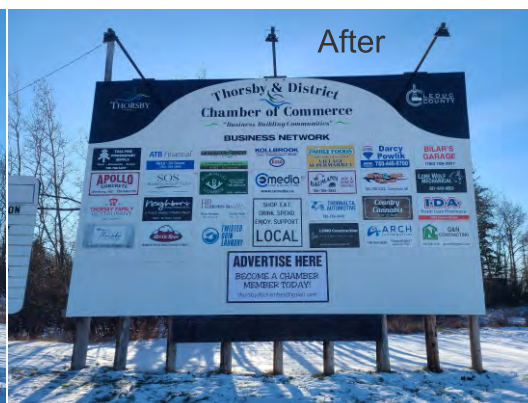
Volunteers updated the Chamber sign coming into Thorsby on Sunday, October 29. Thanks to G&N Contracting for the lift, CE Media Signs & Promotional and all of the Thorsby & District Chamber of Commerce members and supporters.