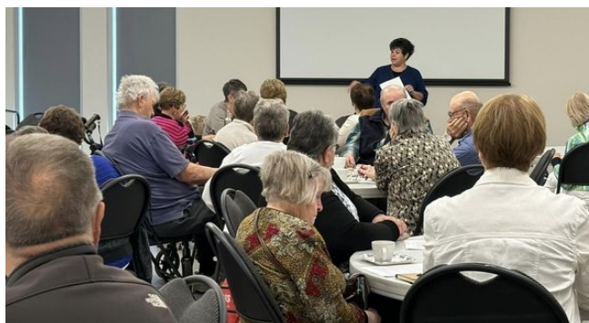
Seniors are gathered for the Information Day. Learning and celebrating together from Warburg, Leduc County, Breton, Wetaskiwin County, Brazeau County.