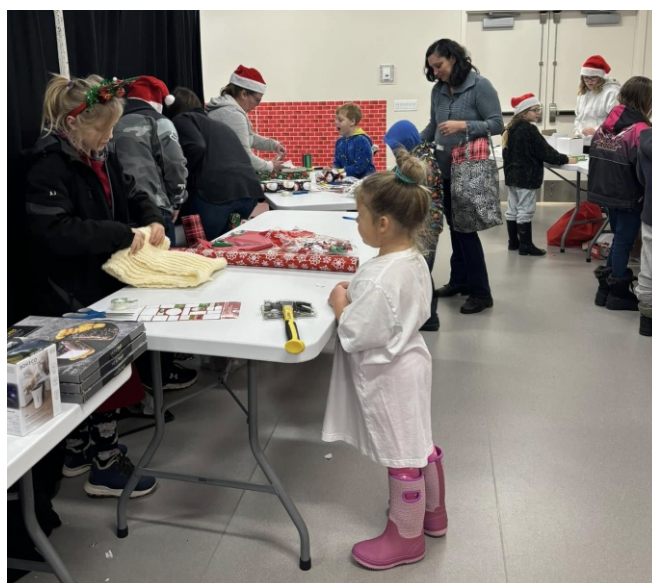
Volunteers helped children under 18 shop and wrap gifts for their family members.