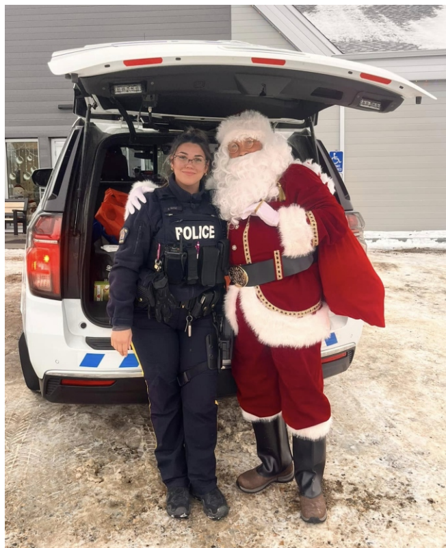
Santa and the Breton RCMP helped fill the cruiser for the Breton Food bank.