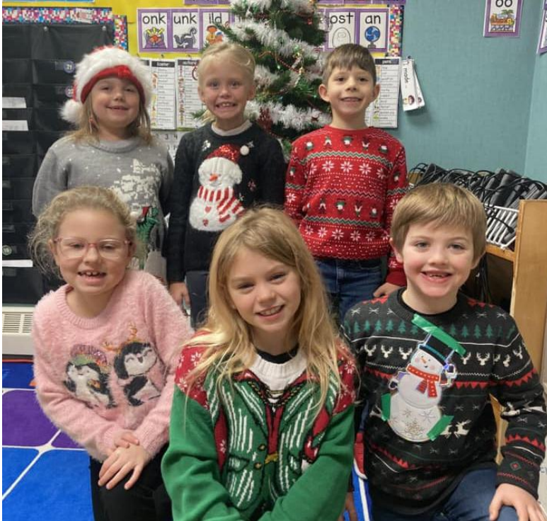
Tacky Sweater Day!