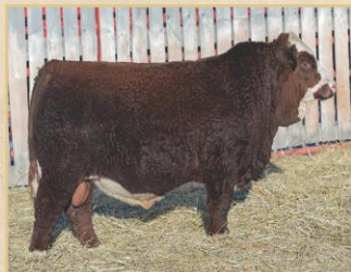
STBS 124M - Polled/Scurried Fleckvieh Fullblood S: Anchor D Gibraltar DS: Shawacres Jahari