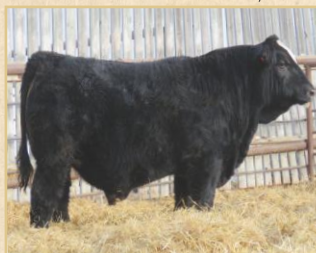
SWS 149M - Polled Purebred S: KWA Slider 196H DS: NGDB Structure 3ED