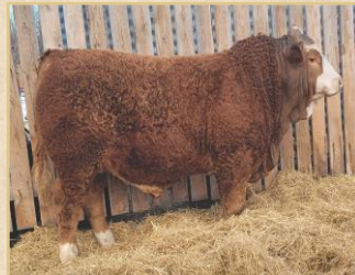
RT 17M - Polled Fleckvieh Fullblood S: Sunny Valley Freedom 22F DS: Champs Bravo