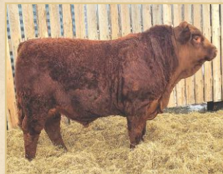
RT 262M - Homo Polled Purebred S: KWA Future 3G DS: KHG Commander 50G