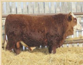
BSSR 13M - Full fleckvieh S: R-Five Gideon 67G DS: POL Eddy 3E