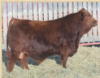
STBS 81M - Polled Purebred S: Oakview Keepsake DS: Harvie Red Summit