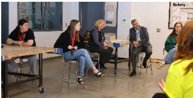
Trustees listen to student concerns during “Working with the Board” outbreak session

Members of BGSD’s Board of Trustees also participated in a session with students about working with school boards, and the role that both they and trustees play in advocacy.