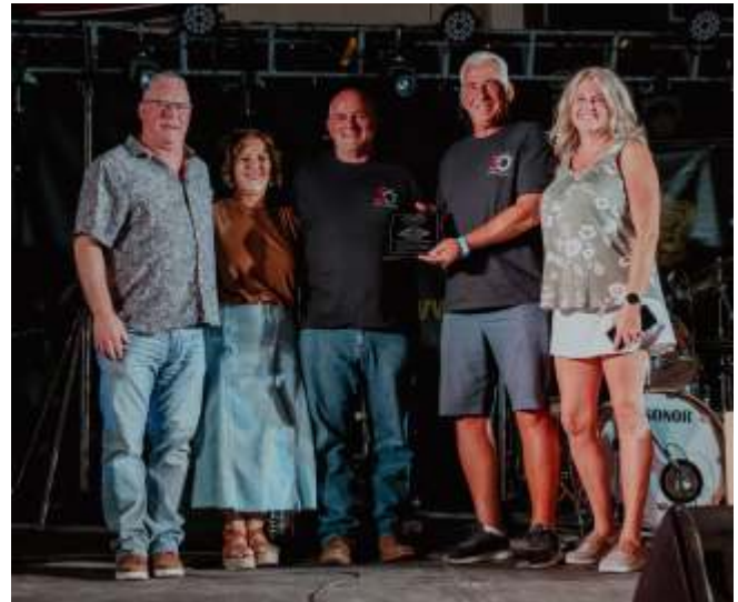
The Thorsby & District Chamber of Commerce presented a plaque to the owners of Arctic Spas in honor of their 30th Anniversary and to thank them for their support of the Thorsby Community.

Well I can attest to that, my family loves our Yukon Arctic Spa built in 2002, and still standing the test of time. There is nothing like a hot tub and a glass of wine after a long day.