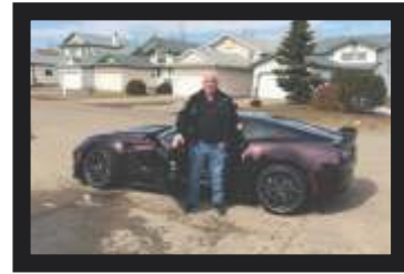
Rod Barrett Memorial Show & Shine