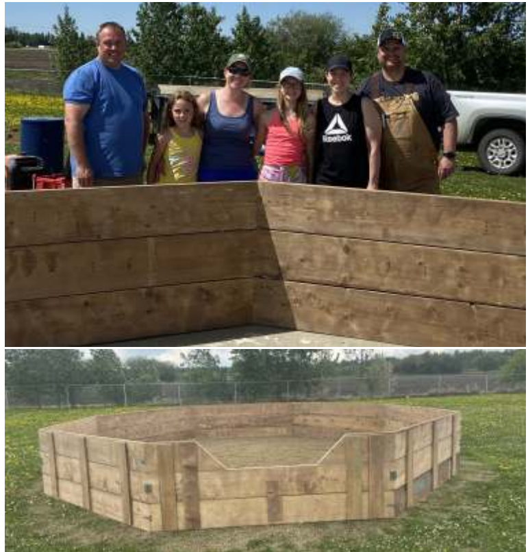
Above - Volunteers and the new Gaga Ball pit at the Thorsby Elementary School

He was a beloved teacher and administrator for 33 years.