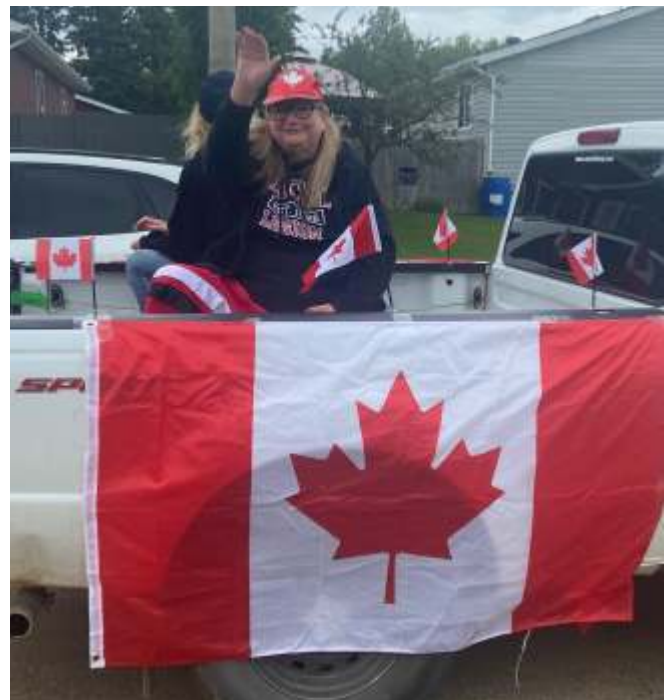
at Warburg Heritage Days on June 21