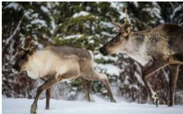
A caribou cow and calf trotting across a snowy landscape in Alberta.